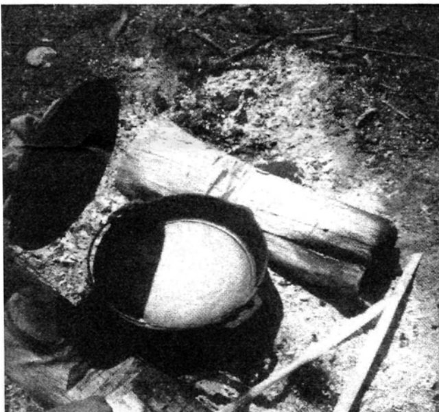
Cattail Pollen Muffins.